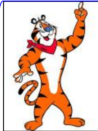
Held: No copyright; concern about usurping the right of original creator

Inflatable costume versions of cartoon characters