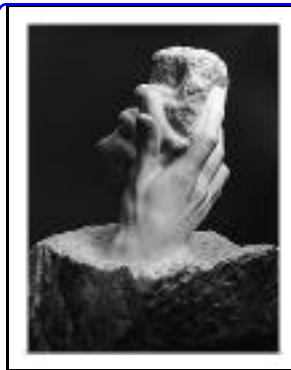
Held: Sufficiently original; copyright extended

Plastic Uncle Sam banks Photo page 102 Held: insufficiently original variation Internal to Batlin v. Snyder