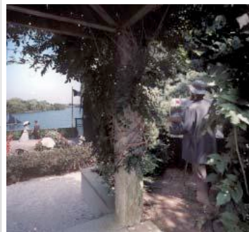
Johnson & Johnson Heir