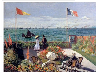
Monet's Terrace at the Sainte Adresse

http://www.washingtonpost.com/ac2/wp-dyn/A62842-2003Sep11?language=printer