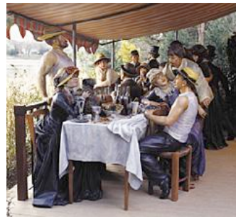
Renoirs Luncheon at the Boating Party